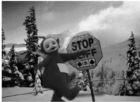
Tinky Winky in Aspen, Co.