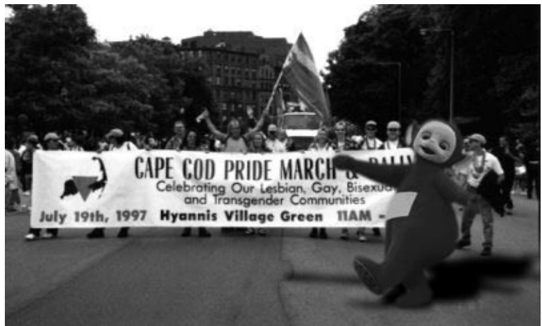
The infamous "Cape Cod" photo

There have also been nasty rumors of Winky's party habits. "Ever since he became famous, he throws these all-night parties with all of his friends. Funny thing is, I've never seen him with a woman, so I don't know what's up," says a "neighbor." "He sings little songs all night long, and then we hear this weird humming sound at about 4:00 am."