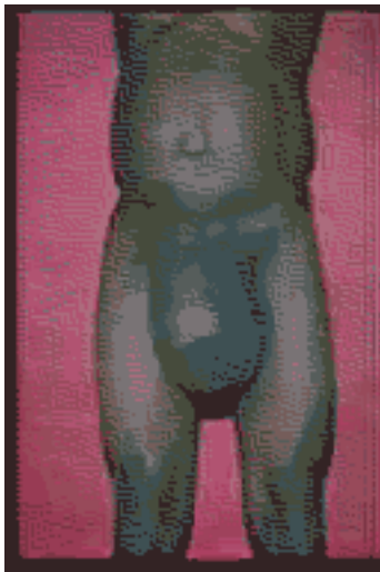
After only 1 week

The formula is simple - You take 25 pills three times a day (so easy !) and within two weeks you have REAL BALLS, and the chicks just can't stay away from you. And the great thing is that this new formula for men can be used in conjunction with Dr. Skip's FEMALE FORMULA for even better results!!