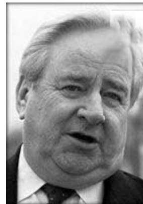
"His Itchiness" outside of his proctologist's office